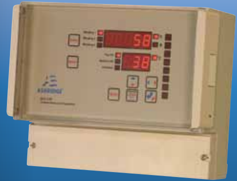
Wall Mounted Version